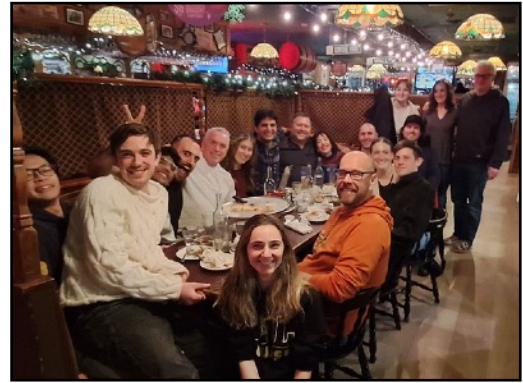
The Dal tournament social at Freeman’s Little New York was enjoyed by all.

Thank you to Squash PEI, Mill River Resort, and to the tournament organizers for running such a fun weekend!